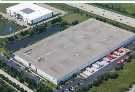
Hyundai Parts Warehouse 1705 Sequoia Aurora, IL 350,000 SF | 19.65 Acres $17,000,000 Industrial Building Hyundai Motor America