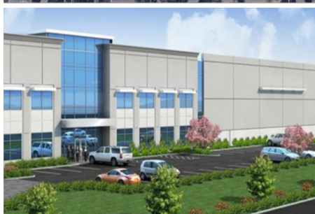
Etiwanda Commerce Center 5750 E Francis Ontario, CA 800,500 SF | 33.0 Acres $50,000,000 Warehouse Distribution Alere Properties