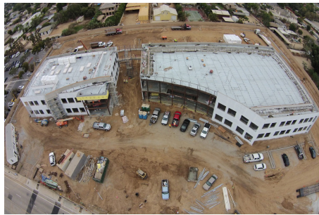
Newport Heights Medical Campus 20350 SW Birch Street Newport Beach, CA 60,000 SF | 4.0 Acres $30,000,000 Medical Office Building Real Estate Development Associates