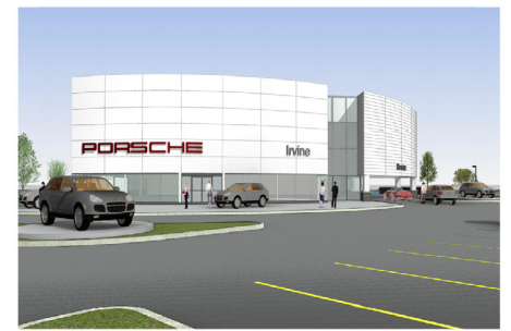
Porsche Irvine 16151 Scientific Irvine, CA 22,000 SF | 3.50 Acres $10,000,000 Car Dealership AutoNation