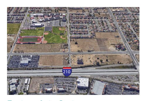
Fontana Auto Center 210 Freeway - Highland, Fontana San Bernardino County, CA 18 Acres $12,000,000 Bonanno Family Trust