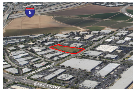
Muirlands Commercial Irvine Spectrum Orange County, CA 4.00 Acres $4,400,000 Shepard of the Hills