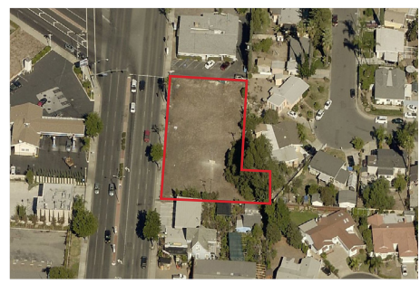
Garden Grove Mixed Use 13322 Eudlid Street Garden Grove, CA 0.58 Acres $1,050,000 Roston Family Trust